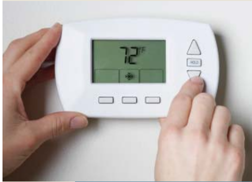
ADJUST TEMPERATURE SET POINTS