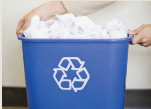
IMPLEMENT A RECYCLING PLAN