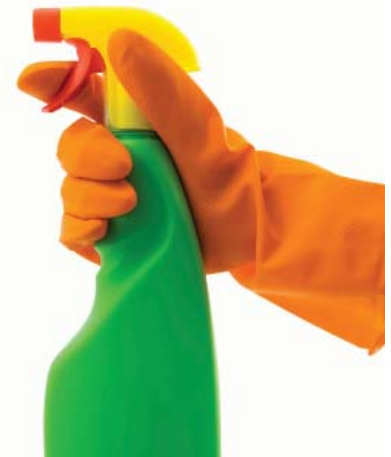
ENVIRONMENTALLY SAFE CLEANING PRODUCTS