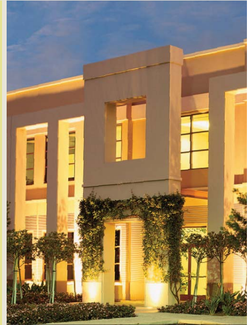
ENERGY EFFICIENT BUILDINGS

IRVINE COMPANY has a long and proud tradition of conservation and energy management. More than ever before, we are applying our knowledge to enhance the places you work. By implementing green practices together, we can help minimize energy usage and improve building efficiencies. Below are suggestions on steps your company can also take toward preserving energy and the environment, some of which can provide significant cost savings. For more information, please contact your Property Manager. To learn more about the Irvine Company's commitment to preserving our natural resources, visit goodplanning.org/stewardship .